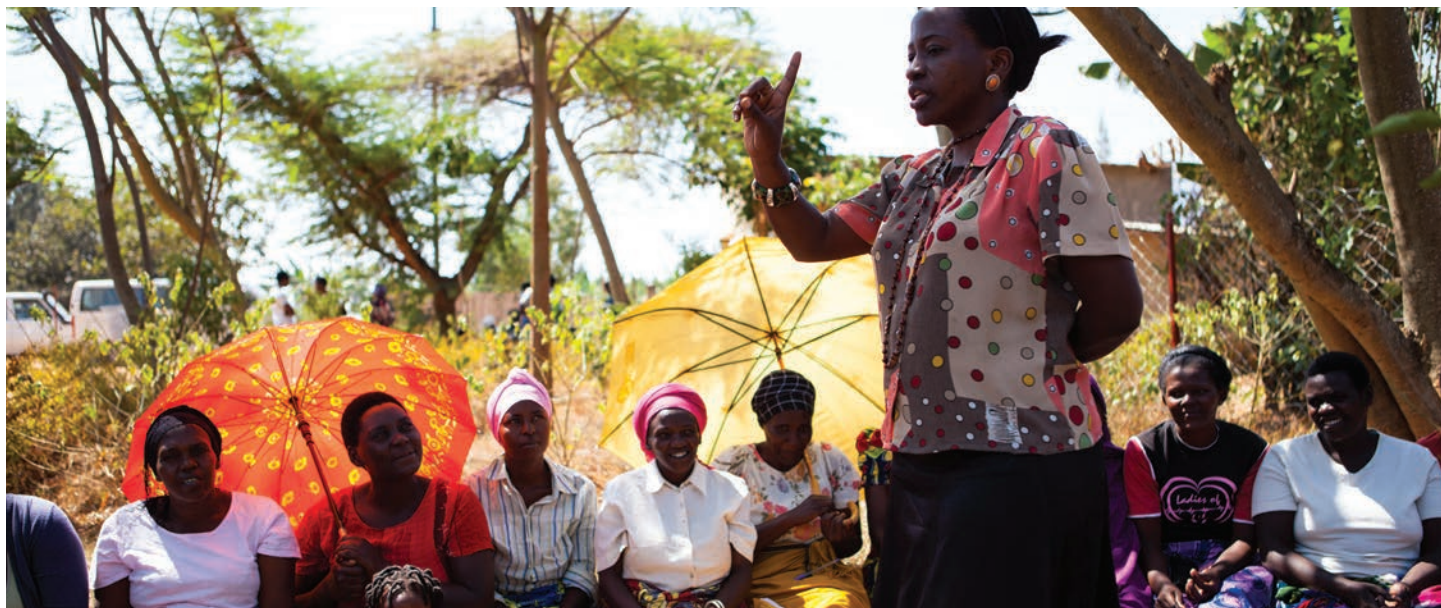
THE SEEP NETWORK