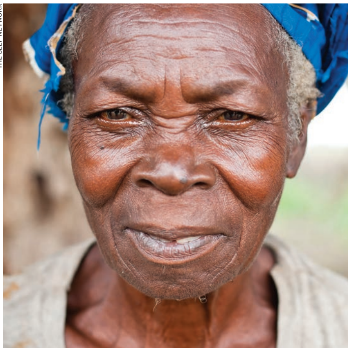
THE SHEEP NETWORK

The net effect of all of these design factors – including product features, how information is provided and decisions are made, partners, and trainer incentives – is difficult to predict. But the often-held view that technology throws up barriers to adoption is probably short-sighted. If DSGs offer substantial scale advantages over past approaches to savings groups, then intelligent design is the answer to power asymmetries and the potential exclusion of more vulnerable individuals.