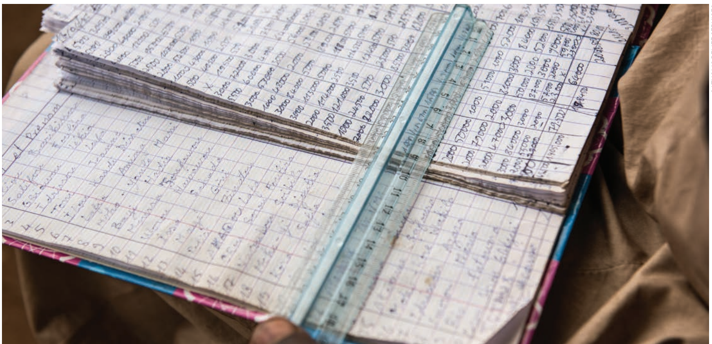
CATHOLIC RELIEF SERVICES

By ‘digitizing’ the recordkeeping and automating calculations, these solutions are eliminating time wasted making calculations and maintaining paper records, and also improving members’ confidence that calculations are accurate. This is a winning combination that should improve confidence, increasing savings rates and reducing the scope for conflict.