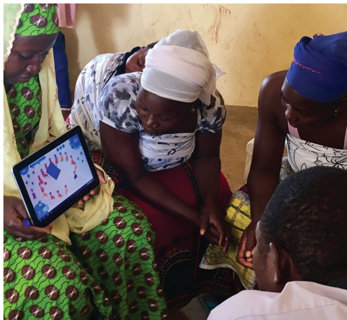
DAN CHURCH AID

Flexibility in loan recovery is the other side of the same coin. Under adverse conditions such as a poor harvest, civil strife or a public health crisis, or simply as the financial circumstances of members change unexpectedly, groups adapt in ways that formal institutions cannot. Loans to otherwise faithful members are restructured without shame or penalty, based on the group’s norms or perhaps just their spontaneous, sympathetic decisions (after all, next time it might be any of the other members).