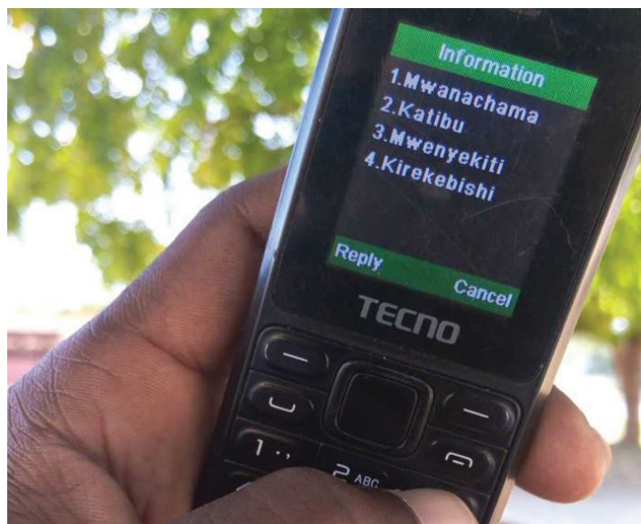
AGA KHAN FOUNDATION

MaTontine offers its solution free of charge to existing tontines, working with fishing, processing, Hajj and other associations that are common in West Africa. Regulations require MaTontine to fulfill 'know your customer' (KYC) requirements directly, rather than make use of information already collected by its partner Orange Money. Customer information is